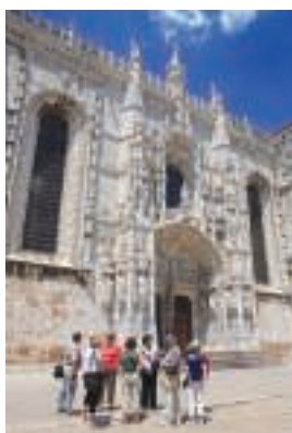
Jeronimo's Monastery in Lisbon

DAY 10 – RETURN TO CANADA. After breakfast, the airport shuttle service from the tour hotel arrives Madrid Airport at 07.00, 09.00 & 11.00 hours. (BB)