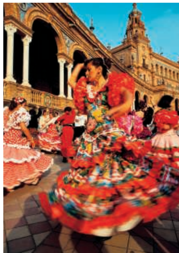
Why not enjoy a fiery flamenco