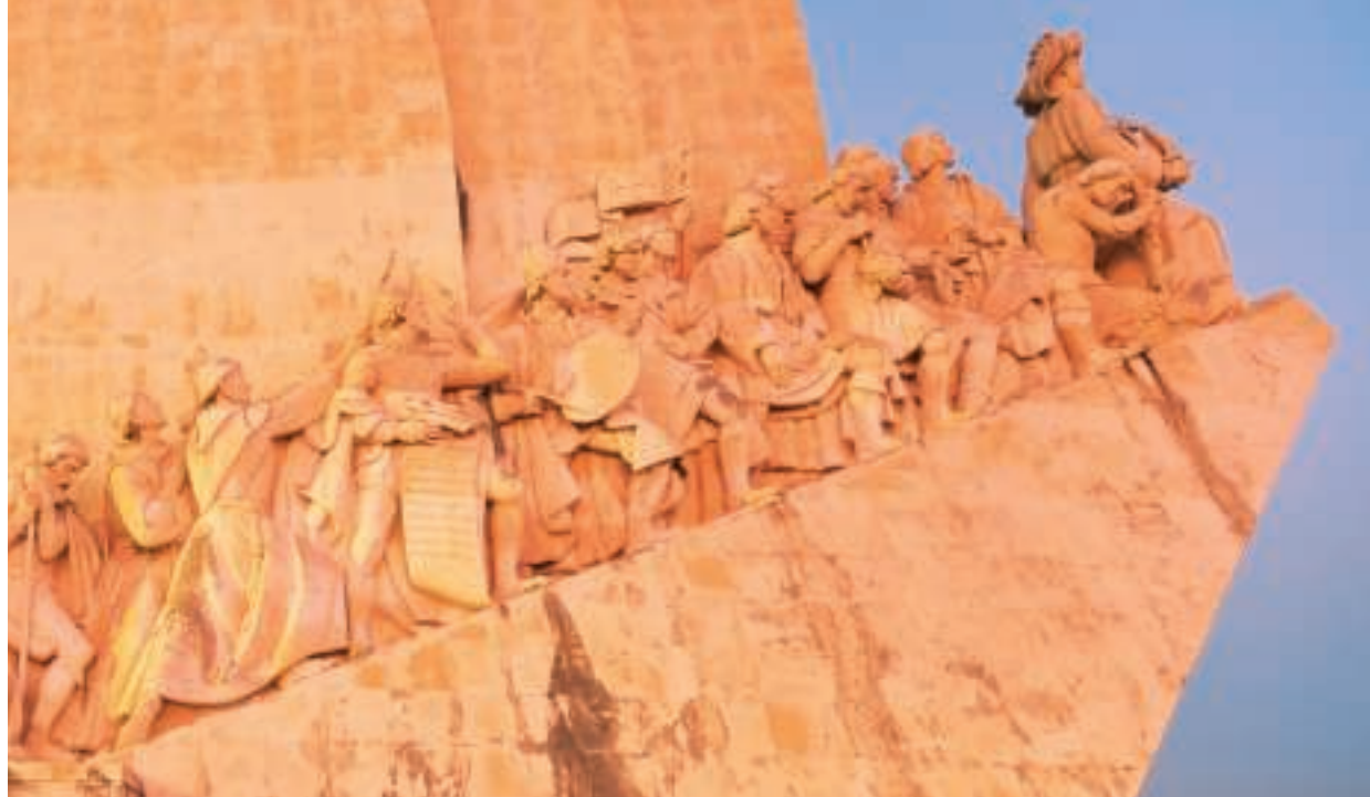
Lisbon's Monument to the Discoveries overlooking the Belem waterfront